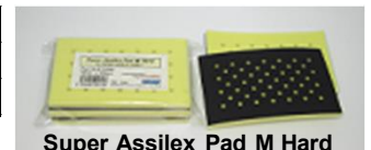
Super Assilex Pad M Hard

* A sheet can be cut to 85mm x 130mm size from the center line (perforated)