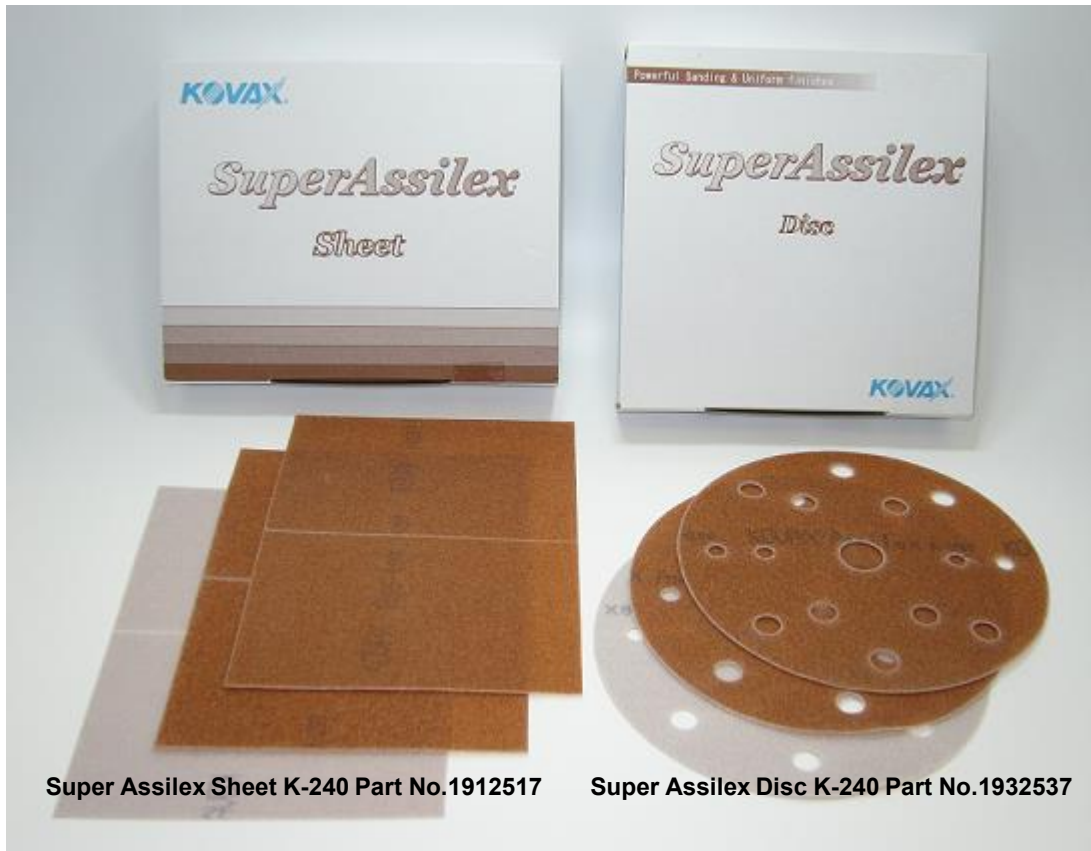
Super Assilex Sheet K-240 Part No.1912517