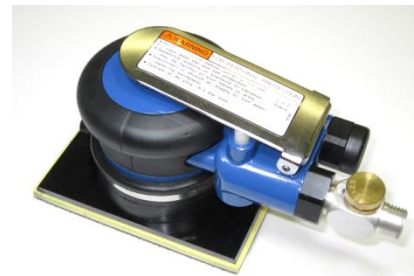
BASander KO-202BA Part No.9100202B

SUPER Buflex , a unique, dry sanding integrates an ultra-flexible latex abrasive sheet and a exclusive soft pad that cuts fast with a shallow scratch pattern which is easier to polish than grit 3000 or finer. Due to it's flexibility, Buflex can polish perfectly without altering original paint texture. Extremely uniform and shallow scratch pattern are the main reasons why Buflex system can produce beautiful finishes in much less time . Now, you can achieve “Zero Water” system upto Super Buflex !