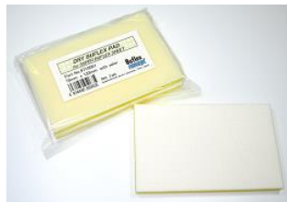
Dry Buflex Pad with velour Part No.9710061 (applicable also for KO-202)