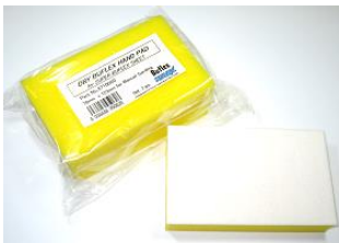
Dry Buflex Hand Pad Part No.9710060